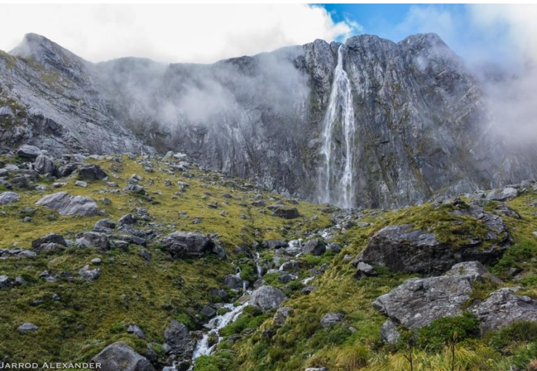
The Upper Sinbad gully meadow