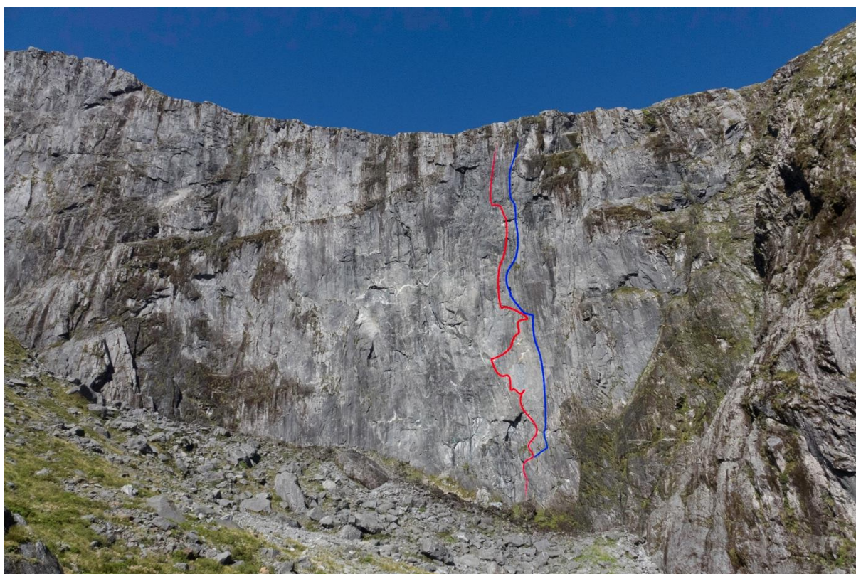
The Sinbad Wall. Blue: Shadowlands (27) Red: Weatherspell (30)