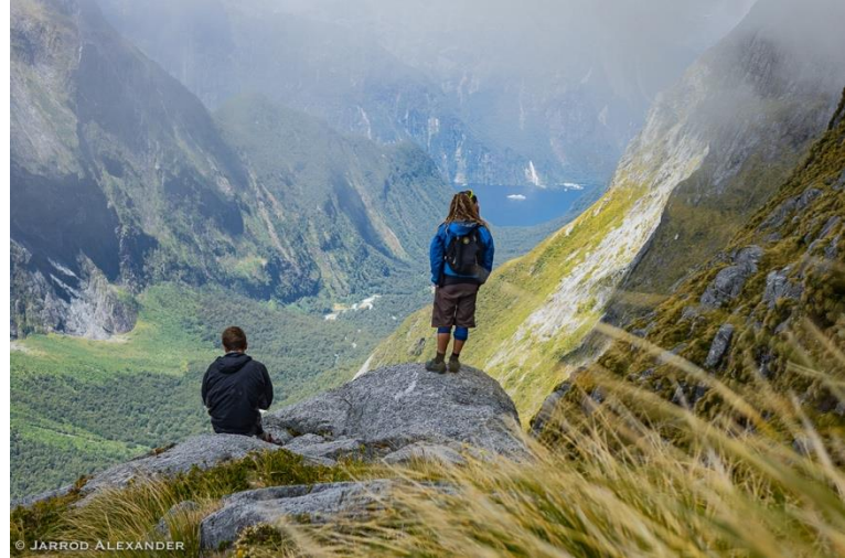
Zac and Jake looking back along Sinbad Gulley with Milford in the distance