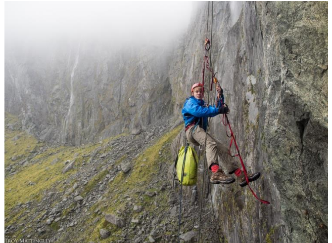
The author jugging up the fixed lines on day two