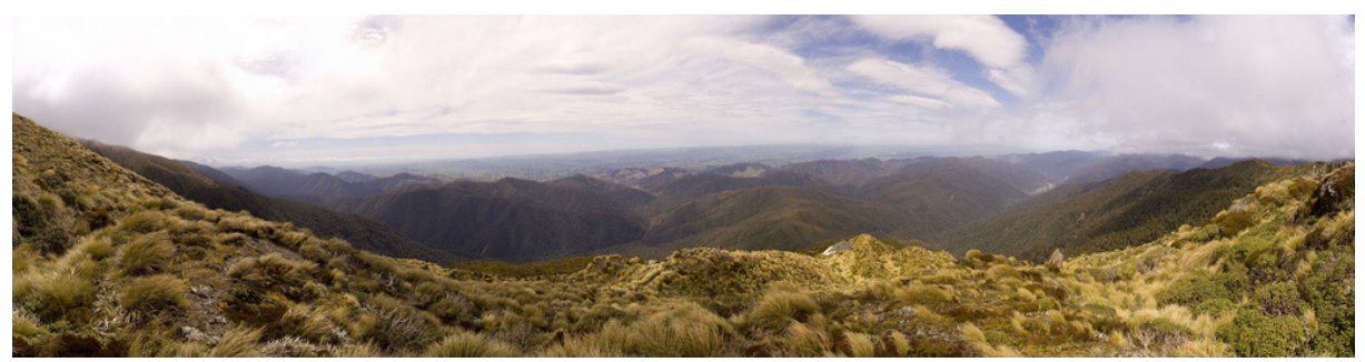
View from Powell Hut

Preferences for the type of bookable accommodation were for huts (and other types of accommodation) that are equipped with 20 or more beds, in the front country and have less than 10 beds, part of an overnight trip, within 3-4 hours of roads, popular and on popular tracks, and lastly, huts on a fixed loop . Notably where some huts on a circuit may be bookable and others were not meant a tent would have to be carried for the whole trip. This echoes feedback received by the Department of Conservation office in Masterton, where some trampers were frustrated about the confusing mixture of systems where Powell and Atiwhakatau huts were on the booking system and Jumbo was left off in 2014/15.