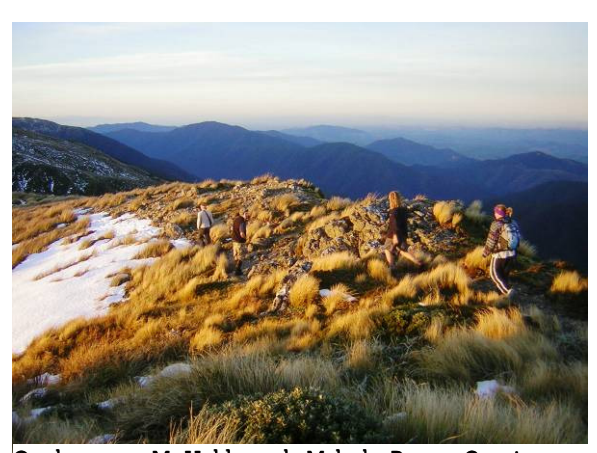
On the way to Mt Holdsworth

The research shows that most people are supportive of more serviced huts (in addition to a number of other types of accommodation) becoming bookable and a minority were